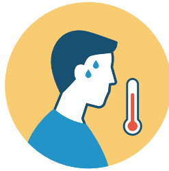
FEVER 100.4* OR CHILLS *or school board policy if threshold is lower

Every morning before you send your child to school please check for signs of illness: