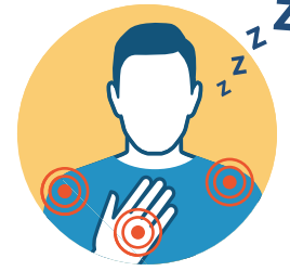
MUSCLE OR BODY ACHES OR FATIGUE