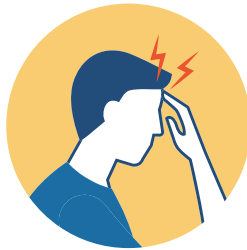
HEADACHE* *particularly new onset of severe headache, especially with fever