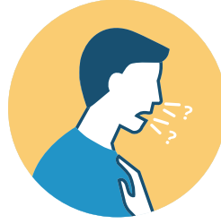
NEW LOSS OF TASTE OR SMELL